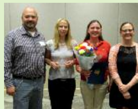
Small Business of the Year Heritage Corner