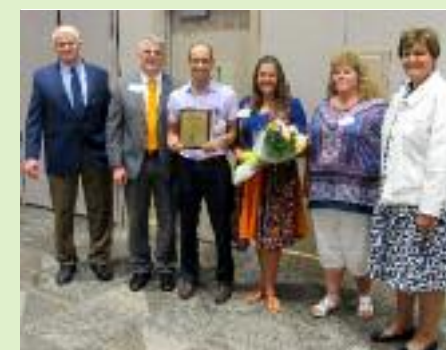
Outstanding Customer Service Wood Haven Health Care