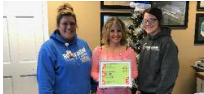
Best Float: Rosenboom Custom Crafted Cylinders