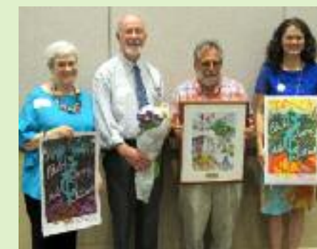
I Love BG Black Swamp Arts Festival