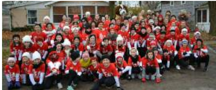
Best Live Show: The BEAT Dance Company