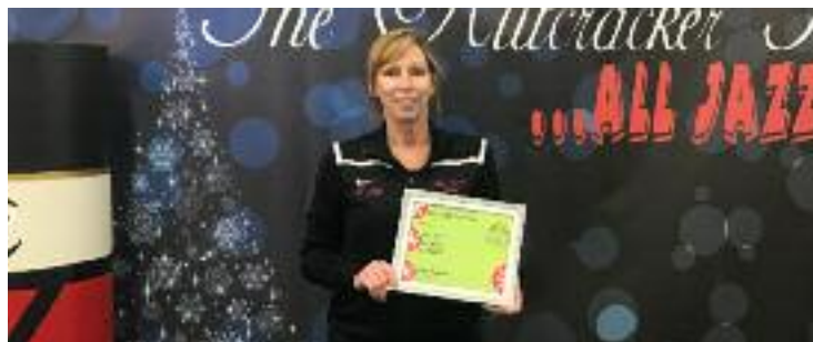
Best Youth: The Nutcracker Ballet...All Jazzed Up!