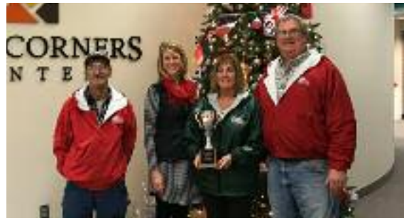
Best of Show: National Tractor Pullers Association