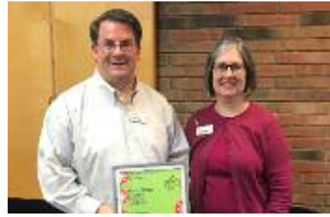
Most Unique: Wood County District Public Library